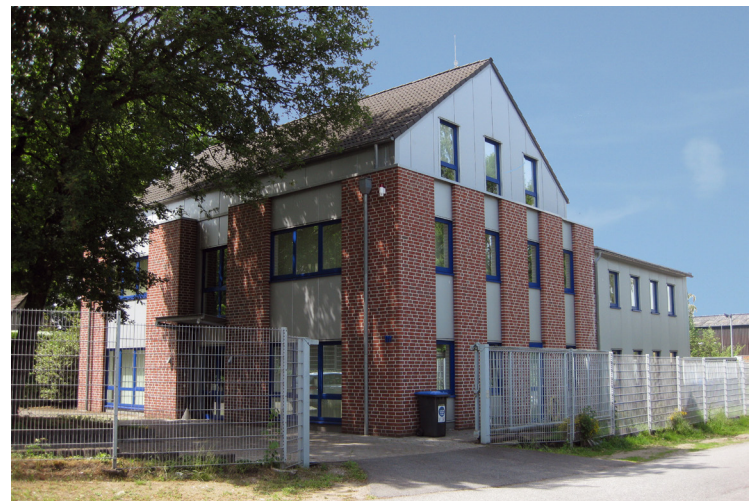
►► Das Firmengebäude der Dr. Bülow & Masiak GmbH in Marl.

Dr. Bülow & Masiak GmbH Victoriastr. 119 45772 Marl Tel: 02365-4146-0 E-Mail: info@buelow-masiak.de www.buelow-masiak.de